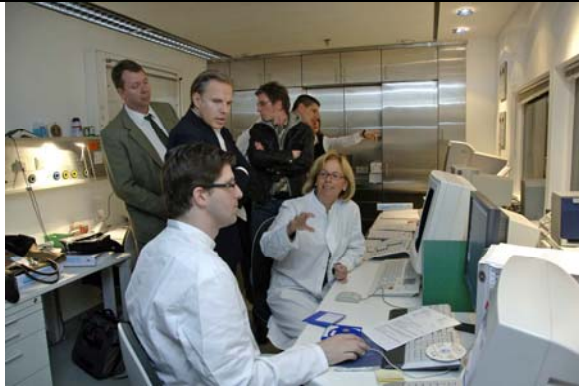
Clinical teaching: discussion during a treatment of deep hyperthermia using the BSD2000 system