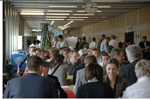
Lunch time! A well deserved break.