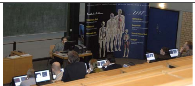
Hands-on training in Semcad-X